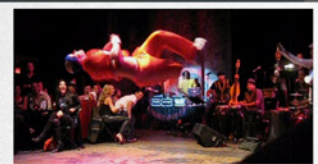
It's all for the professional polish of a dance show at the Broad Stage or Royce Hall or Redcat, but there's something irresistible about watching dancers do that thing at a club: the alcohol flows, the talent is raw, and the atmosphere is charged.